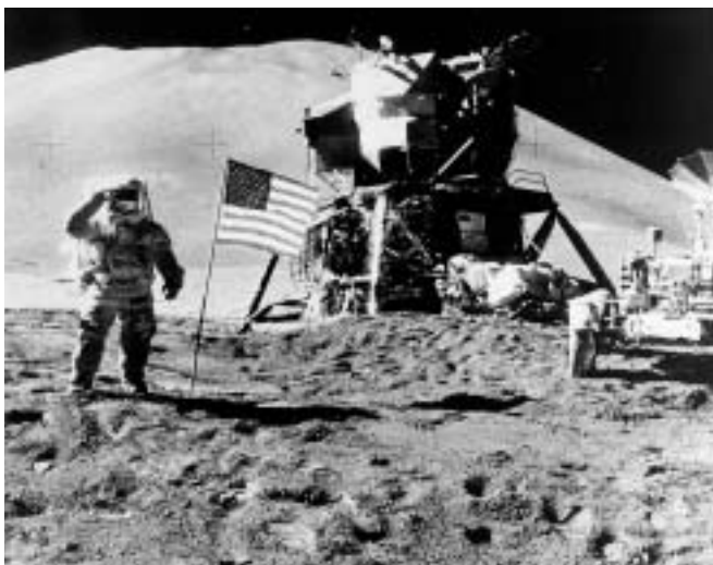
THE CRADLE OF AVIATION MUSEUM

The lunar module that carried men to the moon was built by the Grumman Corporation of Bethpage.