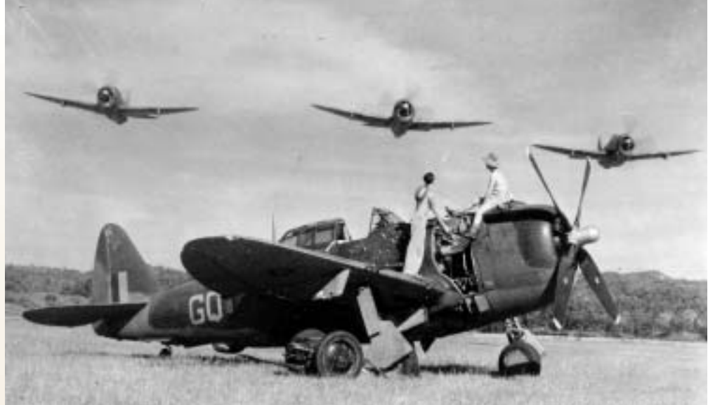
THE CRADLE OF AVIATION MUSEUM

Pier 86 at 12th Avenue and 46th Street New York, NY 10036 (212) 245-0072 www.intrepidmuseum.org