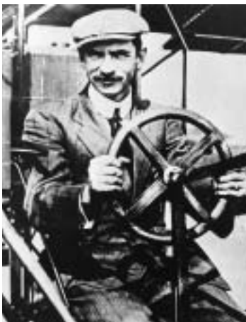
Glenn Curtiss of Hammondsport, New York developed the flying boat (top photo), and is often called the "father" of naval aviation.

There have been at least eighty airfields, large and small, scattered about Long Island, from Queens County in the west to Montauk Point in the