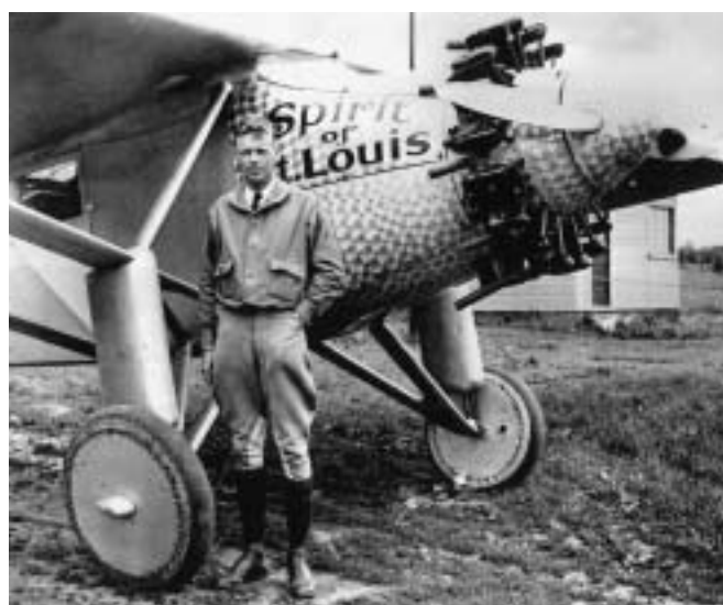
THE CRADLE OF AVIATION MUSEUM