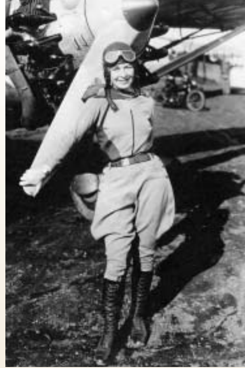
THE CRADLE OF AVIATION MUSEUM

At age nineteen, Elinor Smith was named the best female pilot in the country.